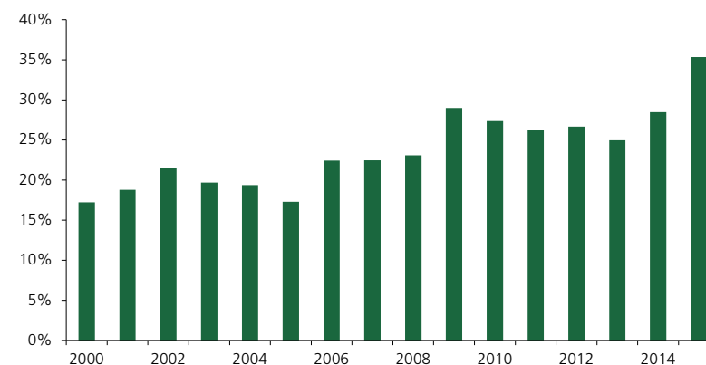
Appeals allowed, UK, 2000-2015 % of appeals determined

Source: Home Office, Immigration Statistics